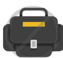
Camera or Binoculars Bag