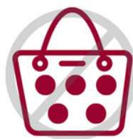
Patterned Plastic Bag