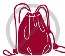
Solid Color String Cinch Bag