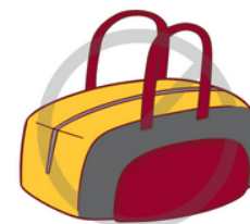
Duffle Bag or Diaper Bag

Exceptions to the Clear Bag Procedures will be made for credentialed media and those with necessary medical items after proper inspection at designated areas.