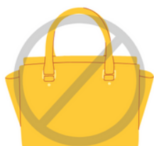
Purses larger than a clutch bag

Prohibited bags include but are not limited to: