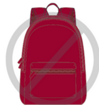
Backpack or Computer Bag