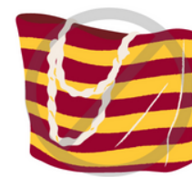
Large Tote Bag