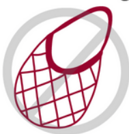
Mesh or Straw Bag