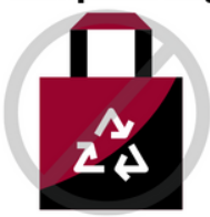
Reusable Grocery Tote